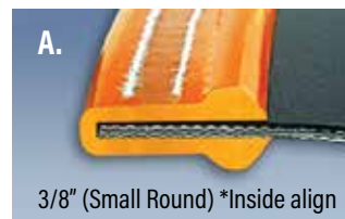
3/8" (Small Round) *Inside align