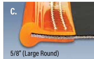
5/8" (Large Round)